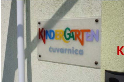
Kindergarden and primary-school Kroatisch Gersdorf