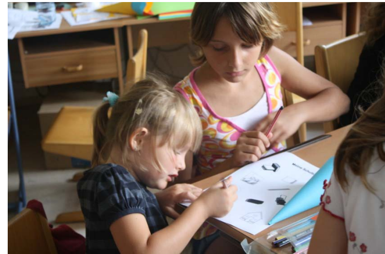
Kindergarden and primary-school Schattendorf